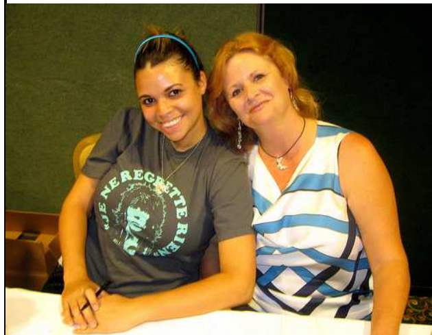
Authors P.C. And Kristin Cast

Zoey Redbird is the main character of the story and she leads her school for many reasons. The number one reason consists around her unique powers that she got at a young age. No other student has powers like her and everyone gawks whenever they see her. When reading these books you will see the changes and events Zoey goes through throughout her time at the House of Night. She deals with much drama in terror between her boyfriends, friends, mentors, family and enemies. Read about how Zoey always seems to get through her exciting and dangerous adventures and also how she deals with the hard change of becoming a vampire. I give this author and these books a five star rating. Their amazing style of writing keeps the readers wanting more and more and can't keep their eyes off the book.